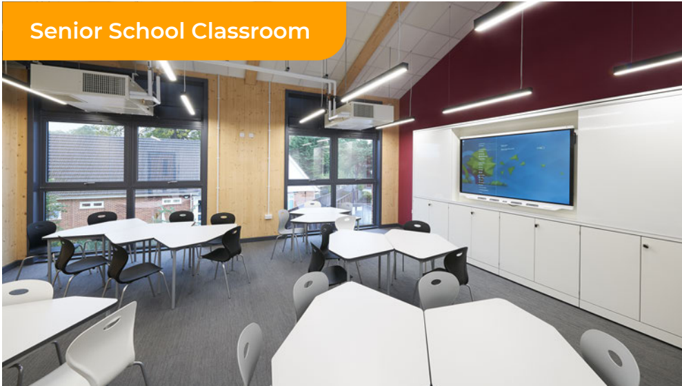
Senior School Classroom