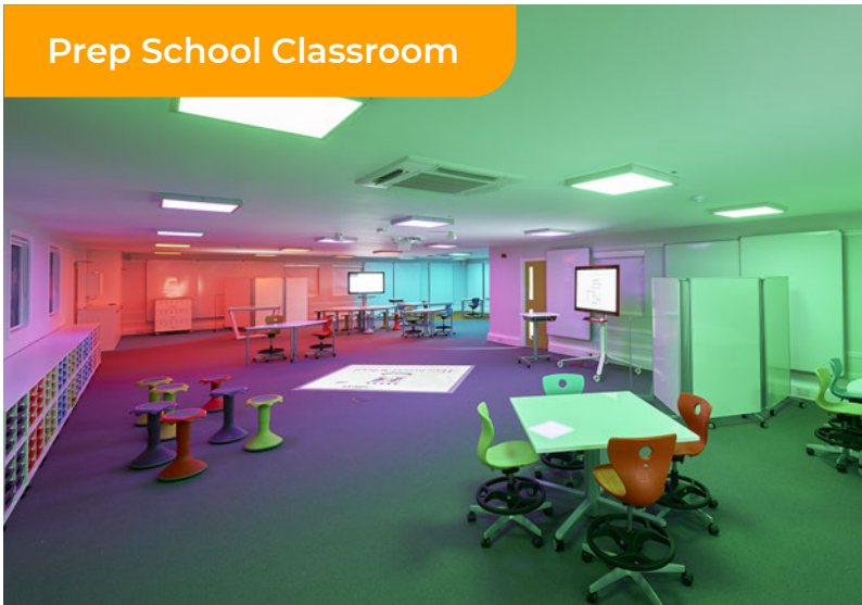
Prep School Classroom