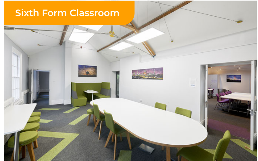
Sixth Form Classroom