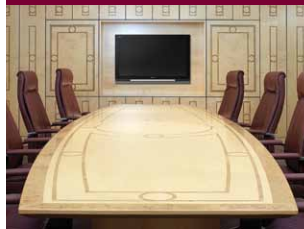
traditional board room

Meeting space is typically used for interactive processes, be it short and informal stand-up conversations, formal meetings or intensive brainstorming. Flexible meeting areas are often key in maximising the use of available space; with board rooms quickly converting to training and lecture format when necessary.