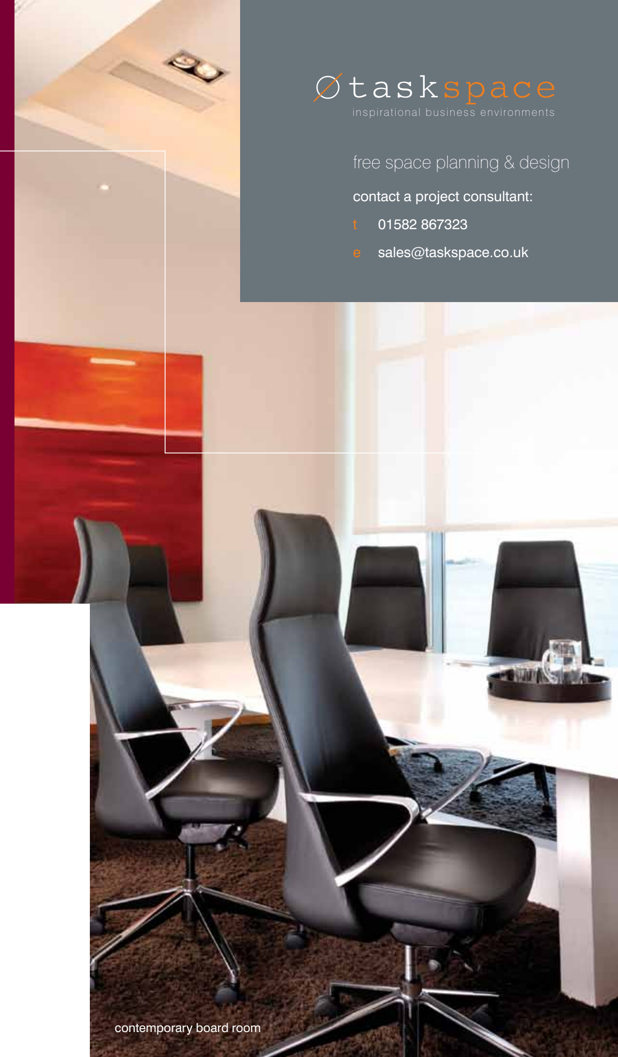
contemporary board room