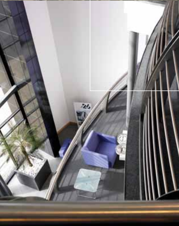
high impact atrium