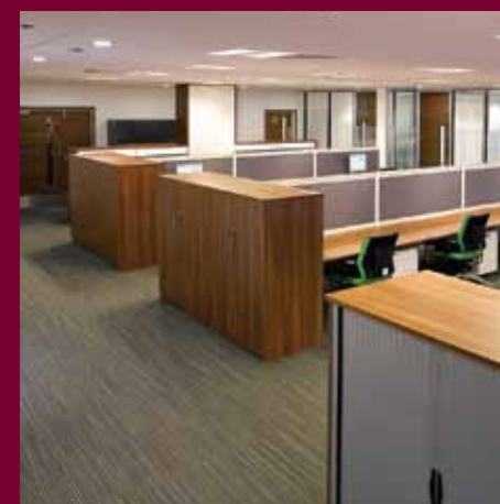
defined office space