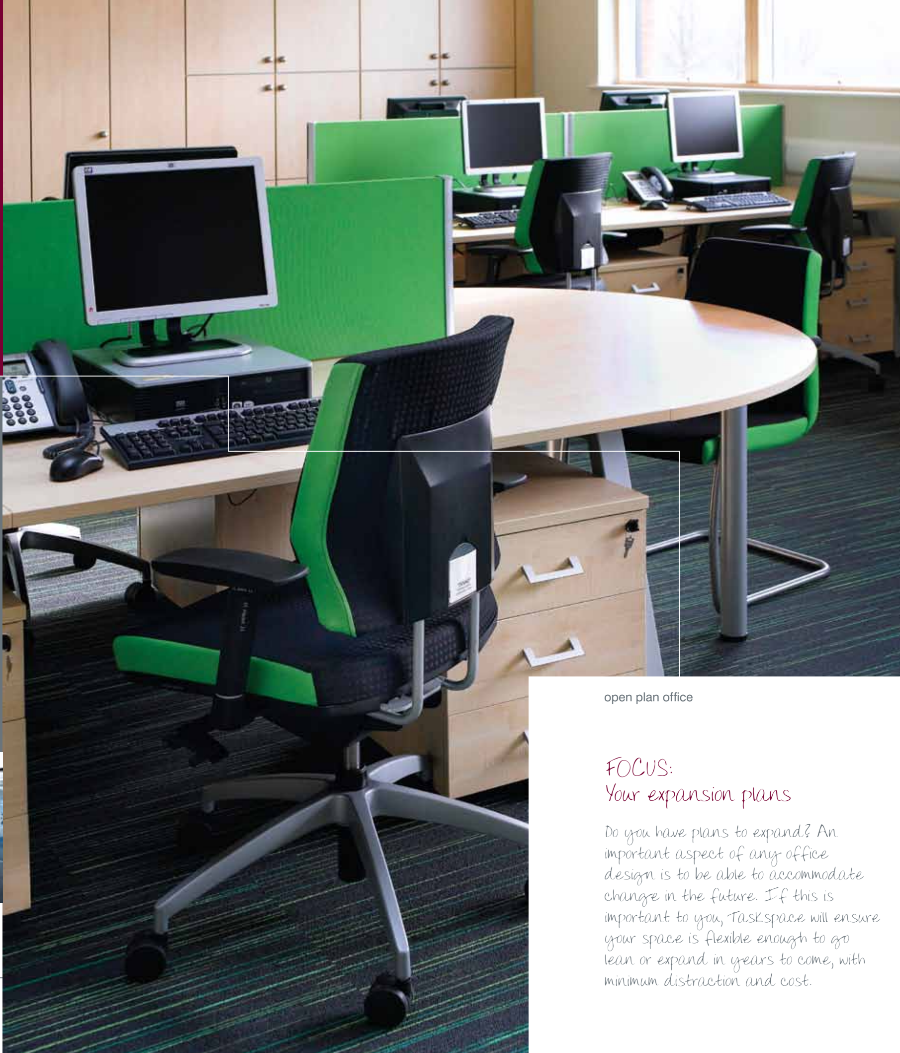
open plan office