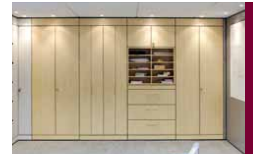
high density storage